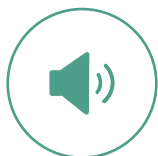
Harman co-engineered speaker