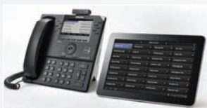
Smart Add-on-Modules (AOM) using smartphones and tablets (devices are sold separately)