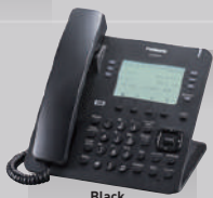
KX-NT630 Monochrome LCD