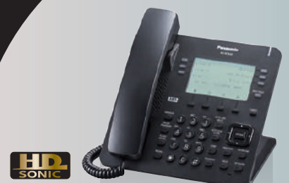
KX-NT630 Monochrome LCD

*In the case of displaying the image of a QR code, it may not be legible with the reading device depending on the size of the QR code.