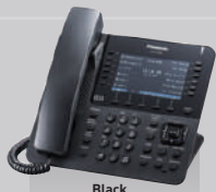
KX-NT680 Colour LCD