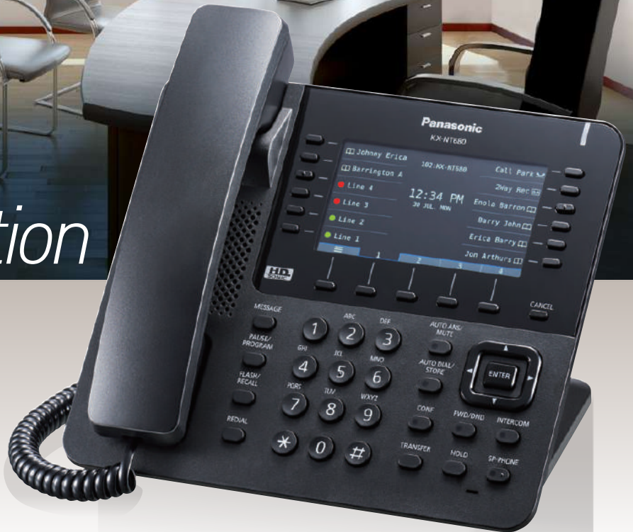
HD SONIC KX-NT680 Colour LCD

With the ever-changing business world in mind, at Panasonic we created a new type of communication equipment, ready for the future. Using a clear colour LCD, integrating High Definition Audio and an enhanced user interface, we provide for the needs of current users.